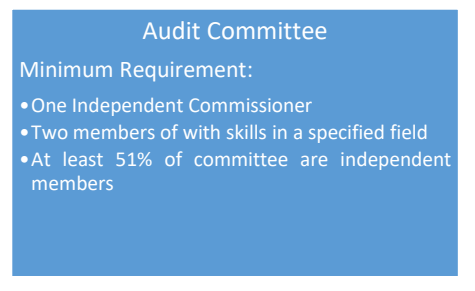
Figure 1. Illustration of Mandatory Committee Independency in Indonesia

The level of independence for the Board of Directors in Indonesian company law is not a large requirement compared to the Board of Commissioner. The Indonesian Stock Exchange no longer requires public companies to have independent Board of Director members. It is assessed that the independence of the board members has been represented by the Independent Commissioners that take the supervisory role of the company. 25 However, as for Banks, the President Director of the Bank must be an independent member of the Board of Director. <sup>26</sup> This is a special requirement for companies in the financial industry to ensure the quality of decision-making for the interest of the company and its shareholders.