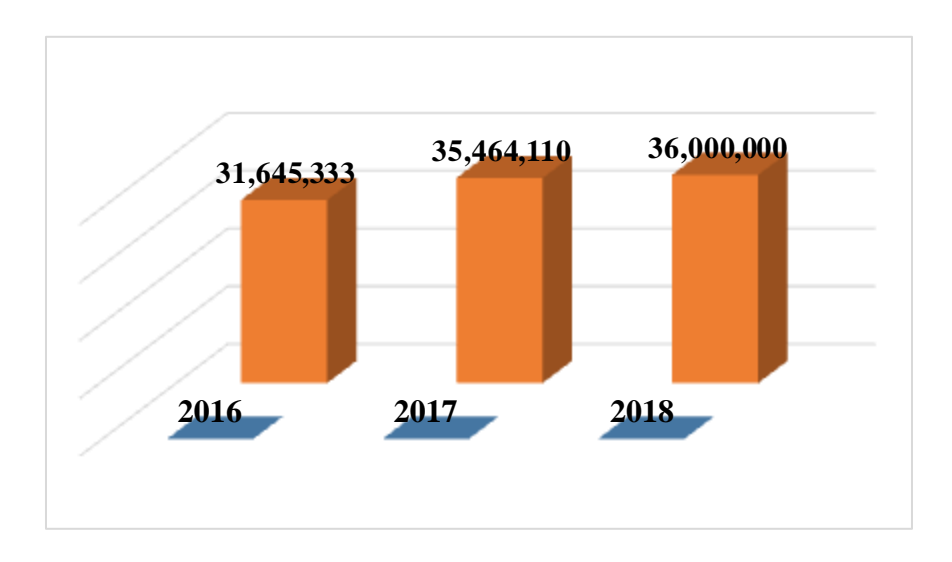
Figure 1.2. A Numbers of Local Tourists

From table 1.2 and figure 1.2 above it is seen the growth tourists visiting Jakarta increased. The tourism sector had managed to become a principal source of tourism revenue for Jakarta. Jakarta is as one of the largest cities in Indonesia, as the capital city of the suspects targeted tourist travel. Tourists coming to Jakarta are not only interested in natural beauty, the unique culture but also expected to be attracted to his food. This is one interest for author to lift up some factors