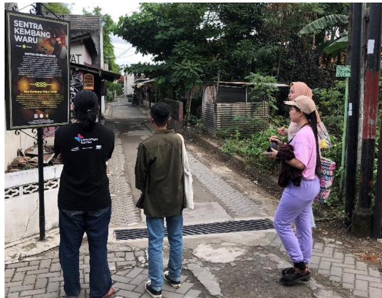
Figure 4. Gastronomic Education

locations but only enjoy the food. Gastronomic Tourism with Djejak Rasa provides tourism education about culinary philosophy and the meaning behind the food. This motivation provides individual benefits to increase knowledge and insight in the Indonesian culinary field.