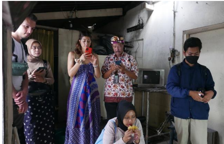
Figure 5. Moments immortalizing gastronomic activities