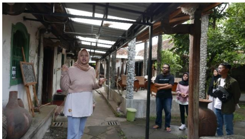
Figure 2. Travel through tourist attractions

The gastronomic trip includes a half day tour which takes around 4 to 5 hours on foot. The distance traveled from the starting point is approximately 4 KM. Tourists feel healthier when walking through the city to see various culinary delights. Tourists can also carry out direct activities to participate in food processing. When visiting a cake or food production house, tourists can try out the correct cooking method firsthand. So physically there are many benefits from going on a gastronomic journey with Djejak Rasa.